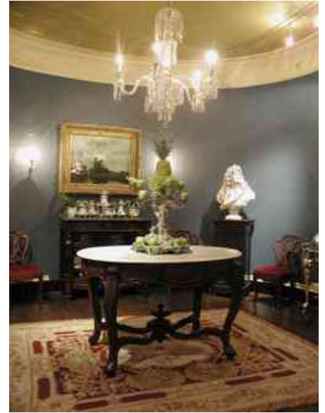
ELEGANT CHANDELIER - The star attraction of the richly furnished oval reception hall is the glittering Waterford chandelier.