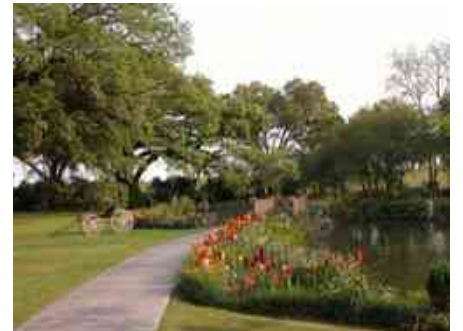
SOUTHERN GARDEN - Meander along a Houmas House pathway and you'll always find something in bloom.